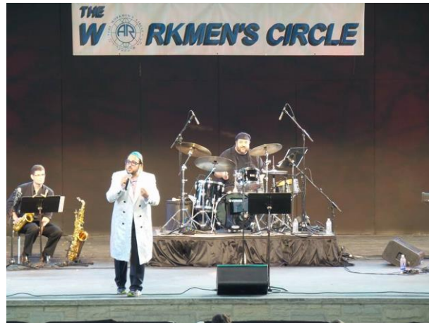
Singer and Performer Lipa Schmeltzer on stage at the Evans Amphitheater at Cain Park for the 2016 Workmen's Circle Free Yiddish Concert in the Park.

After a year of preparation and a packed crowd of nearly a thousand Clevelanders, this year's Yiddish Concert was a great success. Our dynamic and energetic performer Lipa Schmeltzer came in from New York to grace us with his lively musical talents. "It was incredible", said a young boy from the crowd after experiencing Lipa's music for the first time. During the event, the energy and emotion Lipa displayed was only rivaled by his very clear passion for the songs he performed. Toward the end of the performance, Lipa invited all of the children in the audience on stage to join him in dancing and singing to a medley of Yiddish translated versions of popular children's songs (pictured above). After the event, an after-party was held for Lipa and members of the Workmen's Circle and Yiddish Concert Committee. We joined Lipa at the party to congratulate him on such a wonderful performance and invite him to come back and visit us whenever he is able.